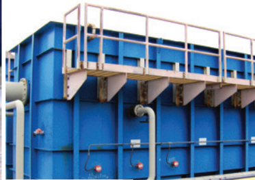
Energy efficient gravity separation operation