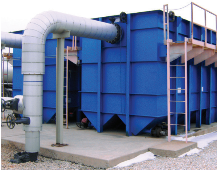
Influent enters through a headbox and is evenly distributed over the length of the cylinder